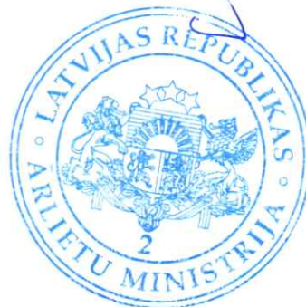
Edgars Rinkēvičs Minister of Foreign Affairs

A handwritten signature in blue ink, reading "Edgars Rinkēvičs".