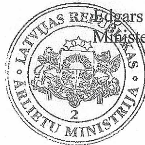
Edgars Rinkēvičs Minister of Foreign Affairs