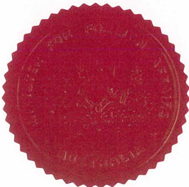
Minister for Foreign Affairs

DONE AT Canberra this 22 nd day of Febraary , two thousand and twelve.